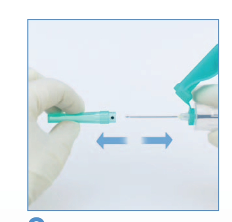
3 Remove protective needle cap