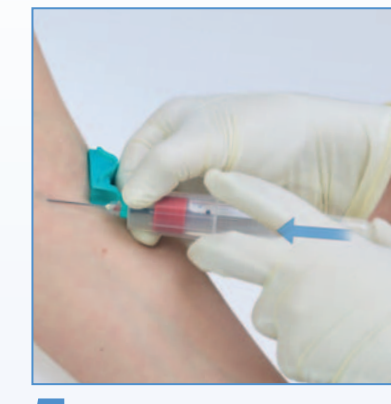
5 Insert the tube