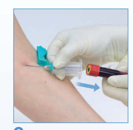
6 Remove the tube