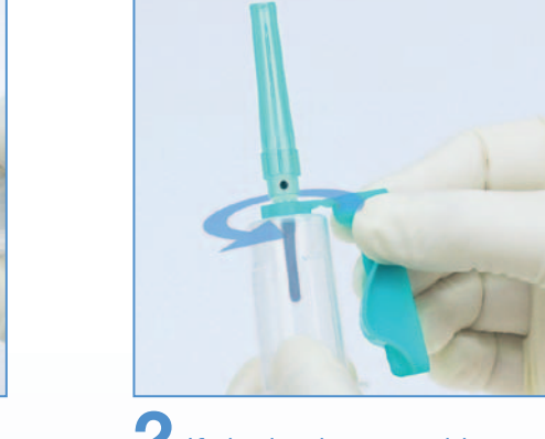
2 If desired, re-position safety shield