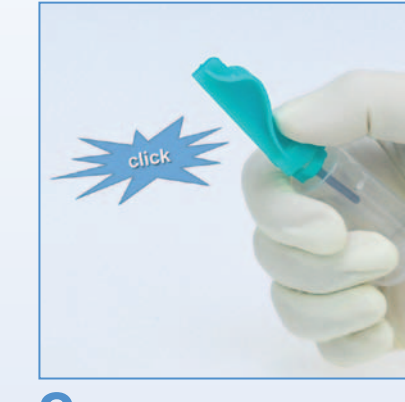
8 Audible click indicates activation